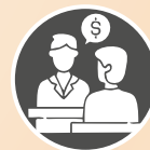
Tax Consultants & Lawyers