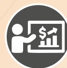
Economists & Academicians