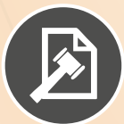
Policy Makers & Regulators