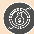
Asset Management Companies