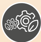
Asset Reconstruction Companies