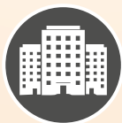
Non-Banking Finance Companies